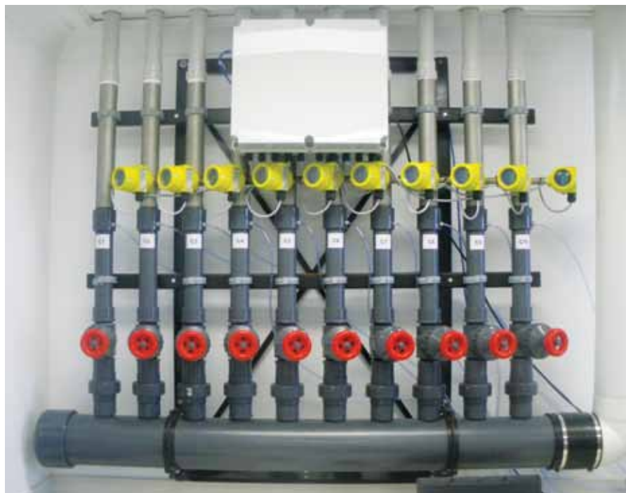
Plate 7: Sample drying system. Sample lines (10 sample + ambient) are drawn from the flow control manifold (Plate 6 above) at 1L/min by pumps mounted above the refrigerator (at top), which push the air through the refrigerated cooling coils which have autodrain of condensed moisture at the base.

Plate 6: Flow measurement manifold featuring 10 mass flow meters with digital output and gate valves to control flow.