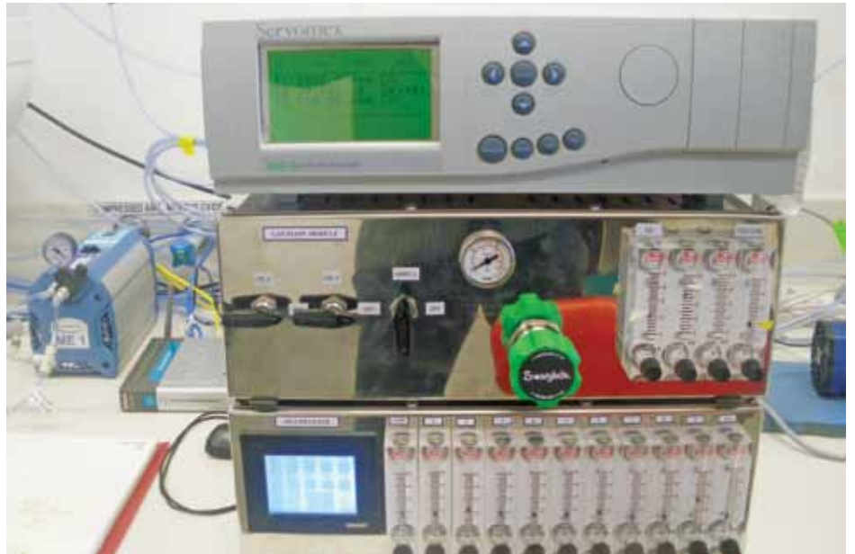
Plate 9: Aisle between chambers shown with all gates shut. These gates are all open to start and the door to the most distant chamber is opened. As cattle walk down the aisle, the gates shown can be progressively closed to ensure the animal does not come back to harm the operator following it down to the chamber. The individual sample flows are then directed to each detector in the Servomex 4100 analyser.

Plate 8: Gas handling and analysis system. The 11 dried sample streams are continuously pushed (1 L/min) through the gas multiplexer (bottom) which features a touchpad allowing the desired number of chambers to be selected for sampling, as well as their purge time and measurement time. Solenoid valves within the multiplexer allow one gas stream to be open for analysis, which involves sucking that sample (at 6 L/min) through the flow control module (middle box) which regulates pressure and creates differential flow to the 3 detectors. The individual sample flows are then directed to each detector in the Servomex 4100 analyser.